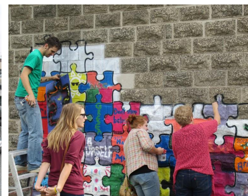
Arts, Culture & Heritage Festival