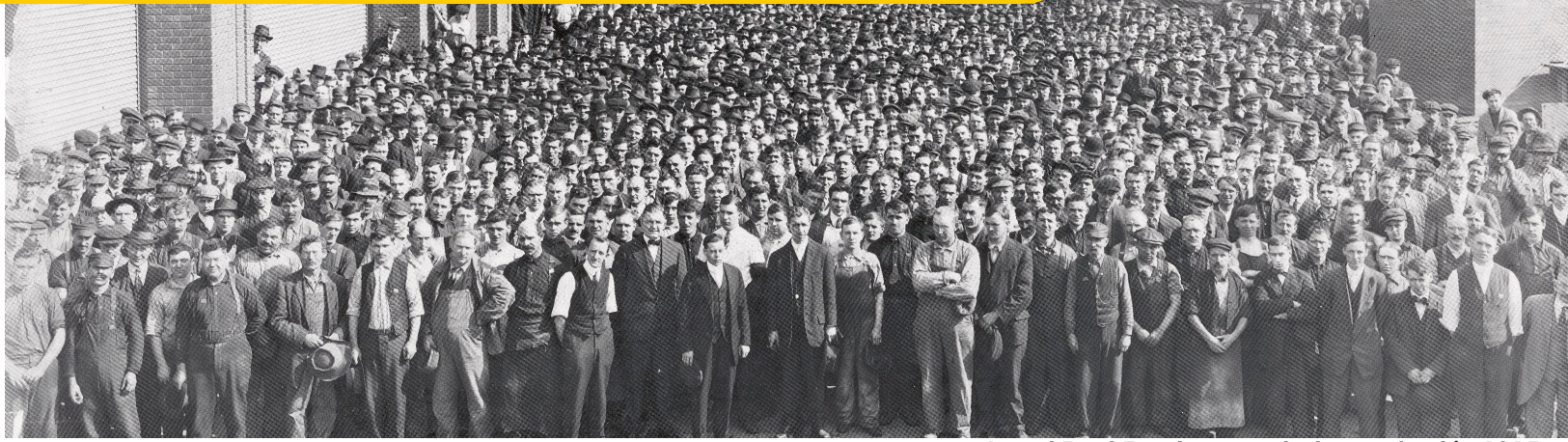
Local Ford Employees photographed in 1915