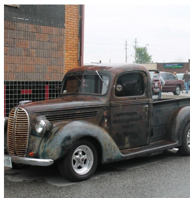
Truck on display in Ford City